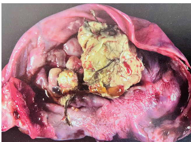
Fig. 2: Cut section of dermoid cyst showing hair and pultaceous material

condition after 5 days of hospital stay. Microphotographic study showed that the cyst was lined by flattened squamous epithelium along with hair follicles and skin appendages. There were focal areas of cartilage and sebaceous glands. There was no immature component or features of atypia, thus confirming the diagnosis of a mature cystic teratoma.