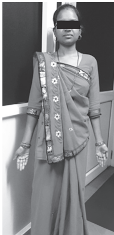
Fig. 1: Triple X female with normal phenotype

This difference in choice for termination of pregnancy could be attributed to parental concern of having a child with abnormal sexual development or infertility, which are usually presented as parts of Turner or Klinefelter's syndromes but not of 47,XXX or 47,XYY karyotypes. Furthermore, Turner's and Klinefelter's