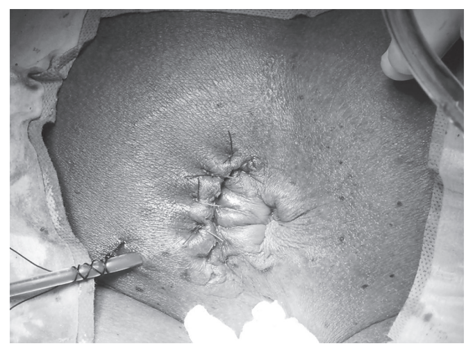
Fig. 3: Final wound closure