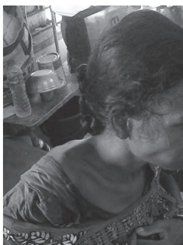
Fig. 5: Supraclavicular hollowing in the mother with few enlarged lymph nodes