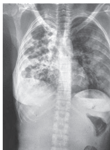
Fig. 6: Chest X-ray

mother, the child was not commenced immediately on exclusive breastfeeding. Repeated episodes of secondary apnea in SNCU were followed by a gastric aspirate revealing AFB 1+ in smears. The placenta had been sent for histopathology and revealed noncaseating tuberculous granulomas. A diagnosis of congenital TB fulfilling Cantwell's criteria was made with hepatosplenomegaly present in both mother and baby (Figs 5 and 6).