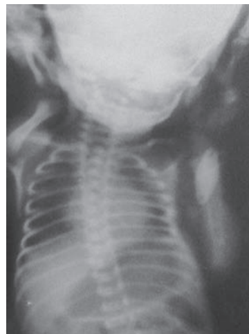
Fig. 4: Same neonate with hepatosplenomegaly on X-ray