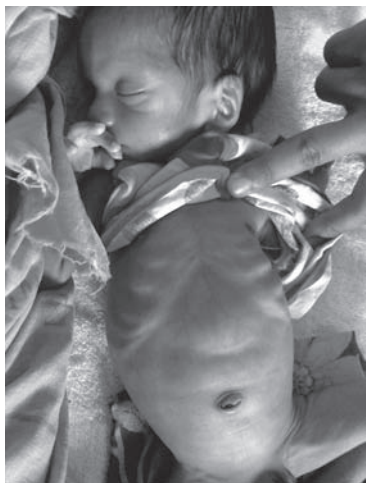
Fig. 3: Neonate with congenital TB with subcostal retractions, dilated subcutaneous abdominal veins