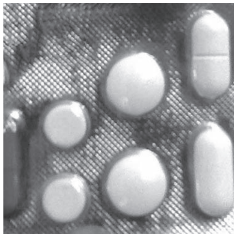
Fig. 1: Intensive phase blister pack

Affected patients were enrolled under the RNTCP-Directly Observed Treatment, Short-course (RNTCP-DOTS) program and received ATT as well as regular antenatal obstetric check-ups in the OPD with special emphasis on fetal and maternal clinical, biochemical, and ultrasound monitoring. Antenatal, intrapartum, and postnatal outcomes of TB in pregnancy were studied along with effects of pregnancy on the course of TB (remission/stable disease/flare up). Any rare diagnoses of congenital TB (Cantwell's criteria) and neonatal TB and their neonatal management were also studied in late