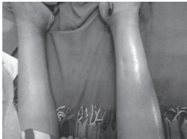
Fig. 8: Deep venous thrombosis

suddenly in third postnatal week with sudden onset chest pain, breathlessness, and desaturation. She could not be revived following this respiratory collapse. We obtained informed consent from her relatives for a postmortem. A saddle thrombus in the pulmonary vessels among findings of lung fibrosis and cavitation was a great learning point for us to be less conservative when instituting anticoagulation for treating medical disorders leading to immobility in the puerperium.