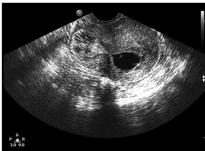
Fig. 1: Mrs X' TVS shows intrauterine gestational sac and part of chorionic tissue is imaged in the previous LSCS scar region slightly invaginating into the anterior wall