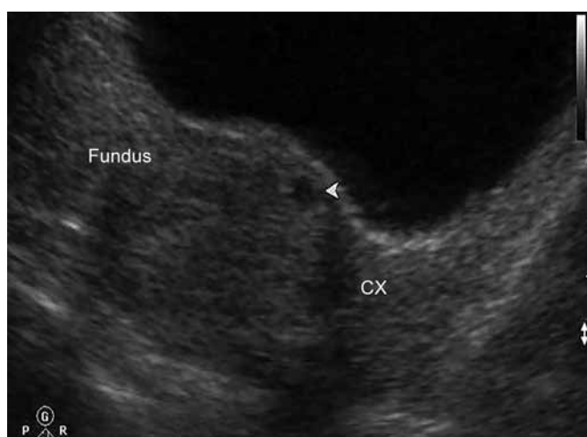
Fig. 3: Mrs Y' TAS sac is located anteriorly and 4 mm from uterine serosa adjacent to bladder anteriorly. No intrauterine pregnancy was identified