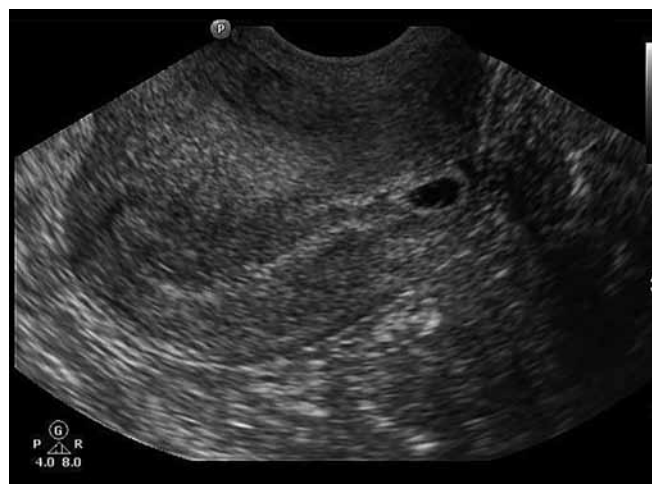
Fig. 2: Mrs Y' TVS shows gestational sac of 5 x 3 mm with yolk sac at the lower end of endometrial cavity