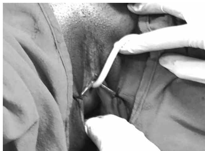
Fig. 1: Mass protruding from the anterolateral vaginal wall

The tumor was enucleated completely through the vaginal route (Fig. 2). It was completely confined to the vagina and the cervix appeared free. Microscopic