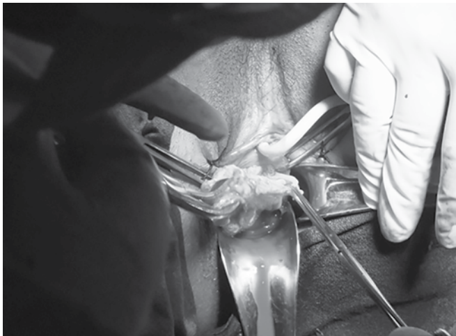
Fig. 2: Removal of degenerated vaginal leiomyoma