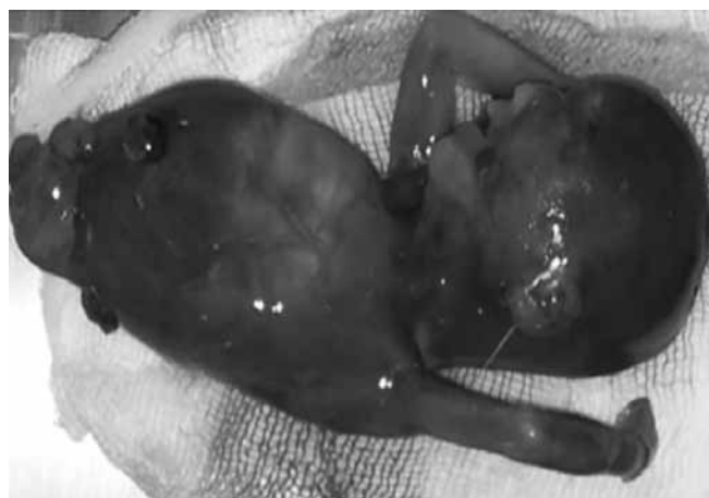
Fig. 2: Mutilated fetus