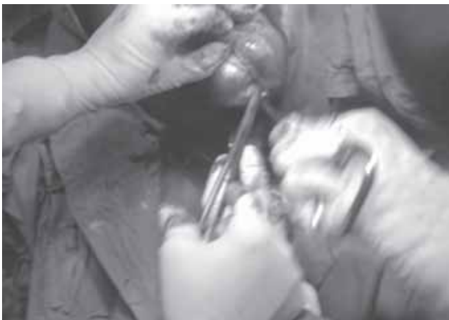
Fig. 2: Enucleation of fibroid after transverse incision over anterior vaginal wall