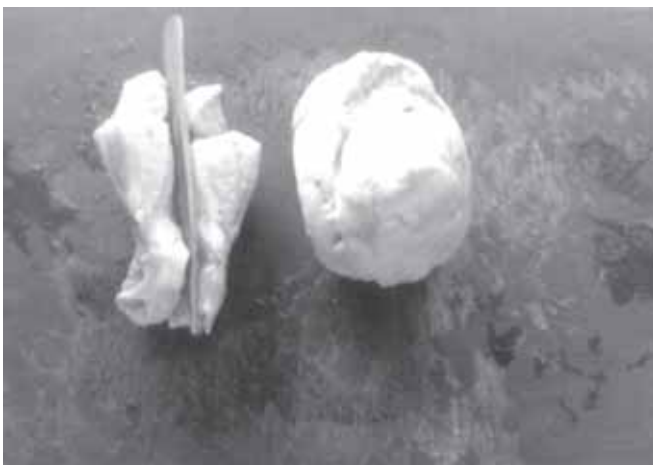
Fig. 3: Postoperative specimen of fibroid and uterus

On ultrasonography, it may appear as mixed or hypoechoic lesion but it is difficult to rule out any connection with uterus or cervix. CT scan, USG and biopsy are helpful to differentiate in between benign and malignant masses. 3