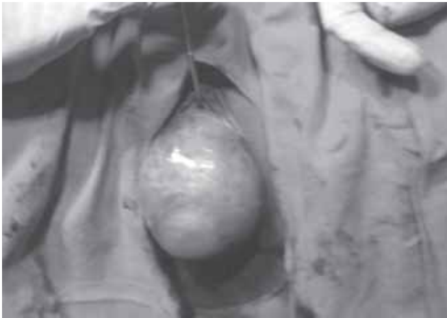
Fig. 1: Preoperative appearance of tumor