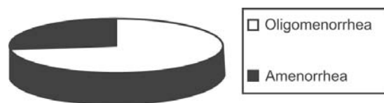
Fig. 3: Menstrual irregularities among PCOS patients

Table 2 shows the hormone profile of PCOS patients and controls. Mean LH of PCOS group was 12.79\% \pm 7.1 mIU/ml and that of control group was 4.67 \pm 3.1 ( P < .05 ). Mean FSH of study group was 5.23 \pm 2.5 mIU/ml and that of controls was 3.25 \pm 2.3 mIU/ml ( P < .05 ). Mean prolactin level was 415.15 \pm 780.5 \mu IU/ml in study group and 389.21 \pm 121.3 \mu IU/ml in controls, (NS). Reference range for LH is taken as 1.2-12.5 mIU/ml and that of FSH as 3.2-10 mIU/ml for adult female. LH: FSH was >2 in 51%; between 1 and 2 in 34% and upto 1 in 15% of PCOS patient.